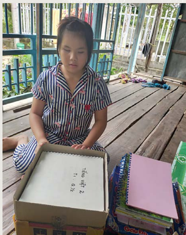
Braille books for use during home learning, delivered to a child who is blind by a CBID worker in Vietnam.

They shared resources and information with key centres in the provinces, which then delivered the resources directly to individual families. Regular visits and deliveries supported home-based learning. Resources included braille books and materials, audio files, music, and other relevant learning tools.