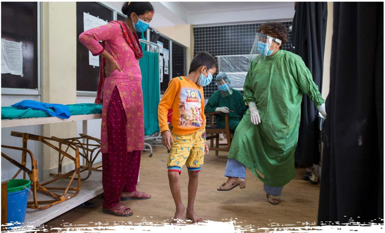
Physiotherapy at a CBM partner hospital and rehabilitation centre in Nepal. (Photo: CBM).

In South-East Bangladesh, a CBM partner organisation continued therapeutic service provision and added some educational activities for children with disabilities and their siblings in the Rohingya refugee camps. All other educational facilities in the camps, including child-friendly spaces and schools, had closed due to the pandemic.