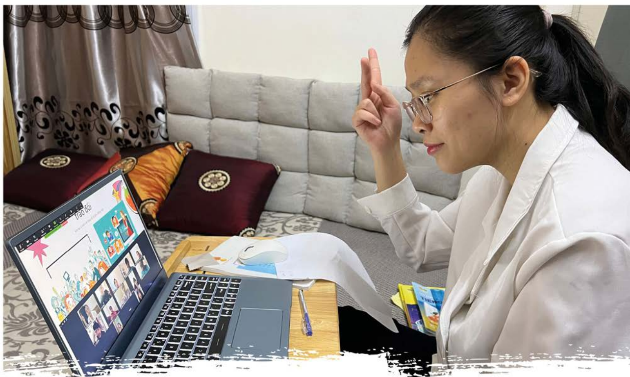
A teacher who is deaf, provides online learning to children who are deaf.

Taking an inclusive approach means that every child, whether they have a disability or not, can access and participate in learning that takes place away from the classroom. During school closures, learning happens at home, and reaching the most marginalised learners has been very challenging. Designing remote learning options using UDL principles can ensure multiple ways for learners to think, develop skills, and grow while at home.