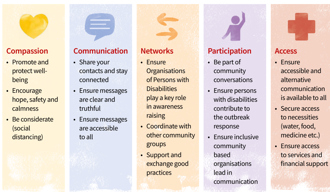
Fig 1: The Disability Inclusive Community Action COVID-19 Matrix 11

All sections and elements of the Disability Inclusive Community Action COVID-19 Matrix are relevant to inclusive education, so it is a valuable guidance tool for all involved in inclusive education. 10