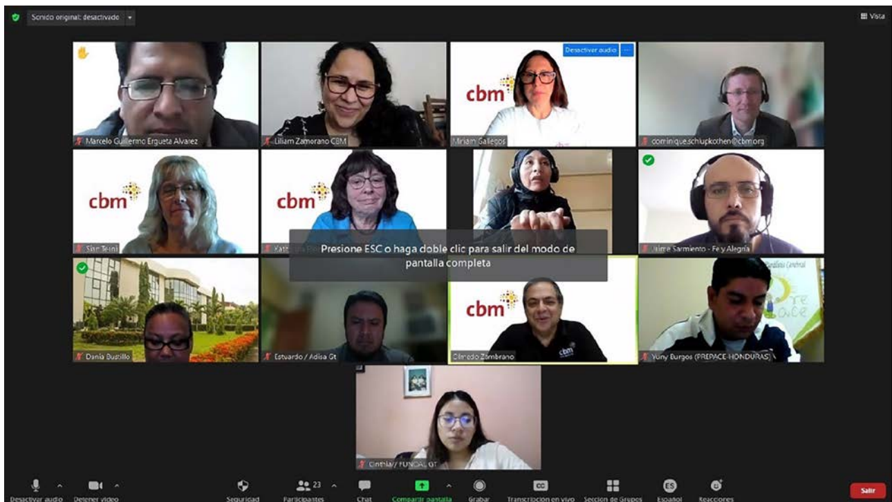
CBM online training of trainers session in Latin America, using CBM's Inclusive Education Training Guide. 22 (Photo: Miriam Gallegos, CBM).

Previously, parents and teachers attended trainings and consultations in the main urban centre. Now they can stay local and receive support via these satellite community centres. Capacity development is delivered digitally to teachers from the urban centre to the community centre. Teachers access the training and other resources either live or when internet connections permit. The centres are also used for other community activities.