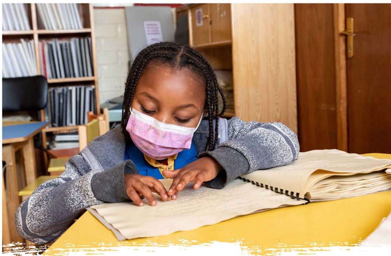
A student with low vision learning to read braille at the German Church School, Addis Ababa, Ethiopia.