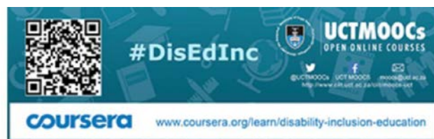
Promotional material for the UCT MOOC