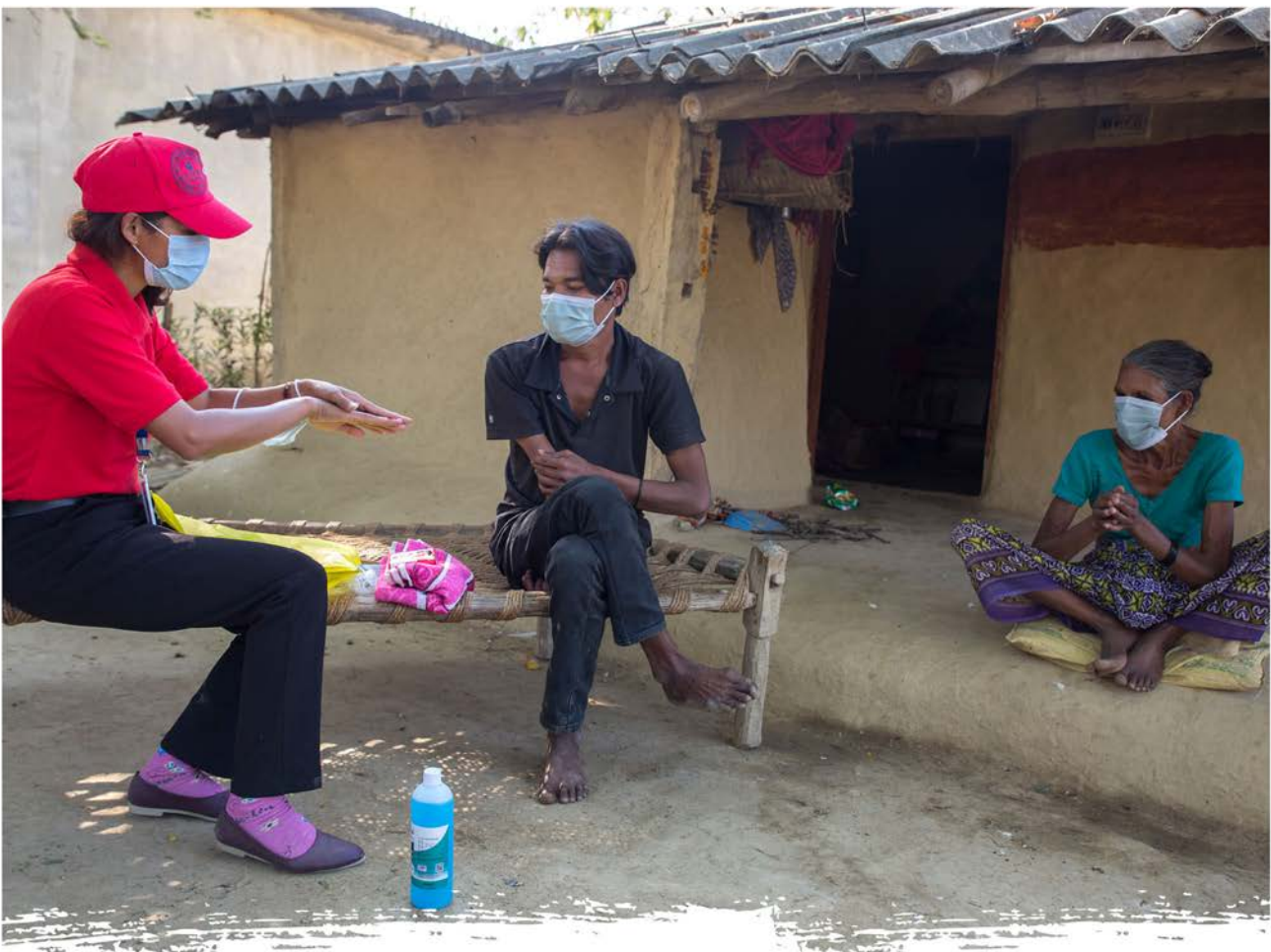
A social mobiliser in Nepal demonstrates the use of materials from a hygiene kit.

The examples illustrate different ways of supporting continued education. They may inspire education practitioners, organisations of persons with disabilities (OPDs), parents, and other institutions involved in providing quality, accessible, inclusive education for all learners. Many of the ideas will be helpful in any emergency affecting educational provision.