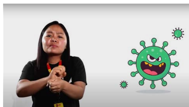
Snapshot from a video about COVID-19 made by a CBM partner in India.