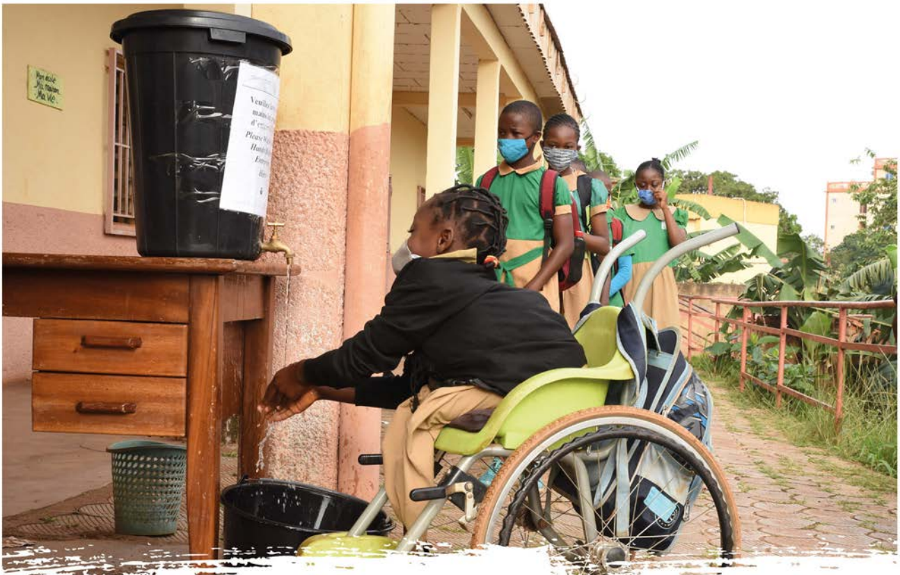
Pupils washing their hands before entering the classroom at a CBM partner inclusive school in Cameroon.

Accessible water, sanitation, and hygiene (WASH), including menstrual hygiene management facilities and practices, are important in education settings generally and vital for mitigating the spread of viruses in schools. Effective infection prevention and control is essential for safely re-opening and running schools during the pandemic. We must keep learners and education personnel safe in schools.