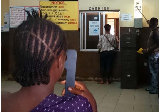
Picture 2: note the area in front of the cashier overloaded with difficult to read signs and posters before renovation (see the improvements in Picture 4).