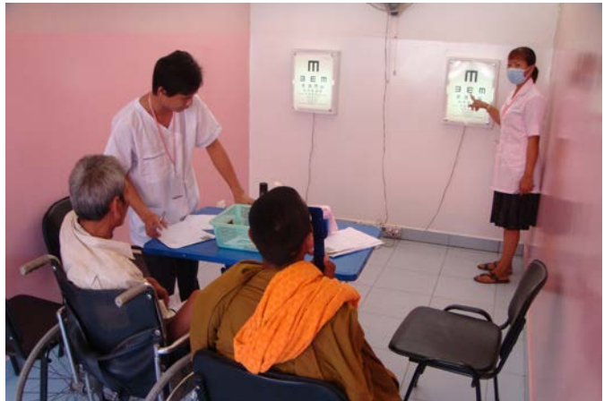
Caption 2: High quality inclusive practice for all people, ensures facilities are welcoming to people with disability and to those facing marginalisation for any other reason.