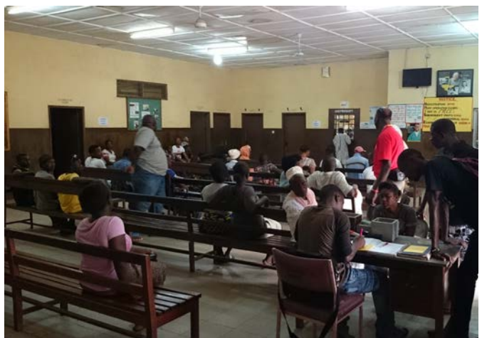
Picture 1: main waiting area of Kissy Eye Hospital before renovation (see the improvements in photo 3).

We are also delighted that Kissy Eye Hospital continued to operate through the period of extreme hardship caused by Ebola in Sierra Leone and the wider West African region. They now ensure that Ebola survivors receive needed treatment for resulting eye conditions, and also create links with community mental health programs and other services.