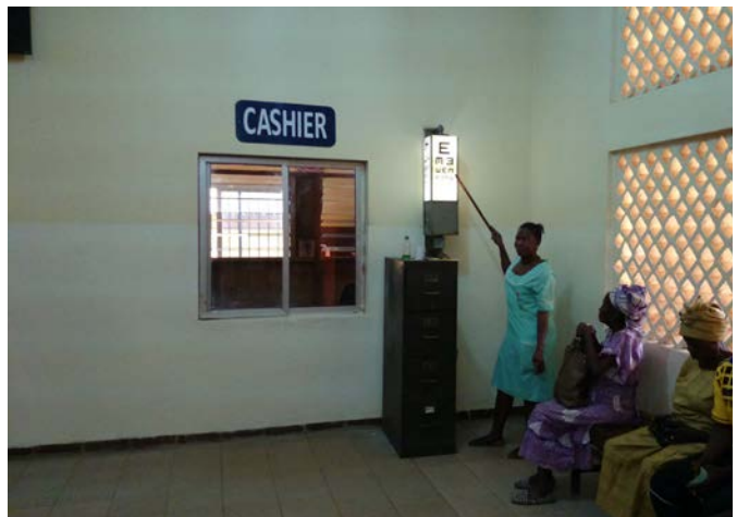
Picture 4: cashier area at Kissy Eye Hospital, after renovation.