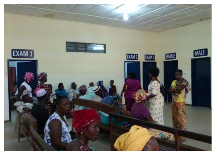
Picture 3: main waiting area of Kissy Eye Hospital after renovation.