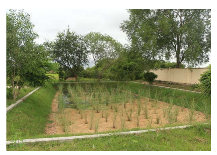
Figure 10: In order to protect local waterways and villages from hospital sewage and run-off water, a well designed sewage system has been constructed. This includes establishment of reedbed pond. Fish have been added to eat mosquito larvae and other insects. Hospital staff use the area alongside the reed-bed to grow vegetables.