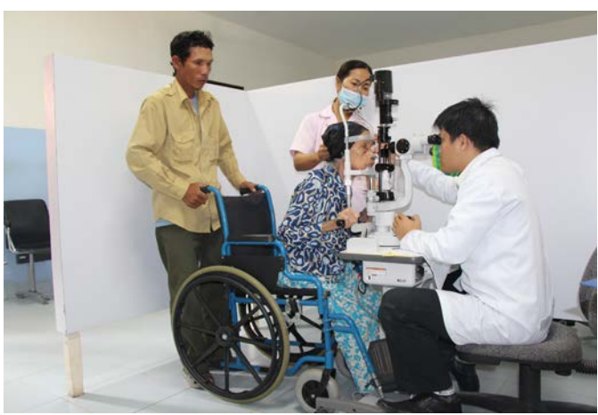
Figure 2: As well as seeking environmental sustainability, CTEH seeks to implement high quality disability inclusive practice.