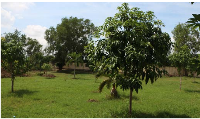
Figure 11: Trees and gardens surrounding the hospital create a cooler, more pleasant environment, and also provide fruit and timber.