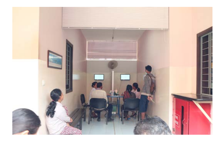
Figure 1: Visual Acuities are conducted in an open room with natural air-flow, rather than in a room with air-conditioning, consuming significant energy.

Climate change is predicted to be one of the largest global health threats of the 21st century. Health care itself is a large contributor to carbon emissions. As an example the carbon footprint of the National Health Service (NHS) in England is estimated at 20 million tonnes of greenhouse gases (GHGs) per annum, accounting for 25% of all public sector emissions in the United Kingdom. We note that the NHS has put in place a Sustainable Development Management Plan, seeking to improve economic, social and environmental sustainability. The authors see it as essential that health services in all countries play their part in reducing carbon emissions and improving their overall environmental sustainability, as part of 'sustainable development'. 2